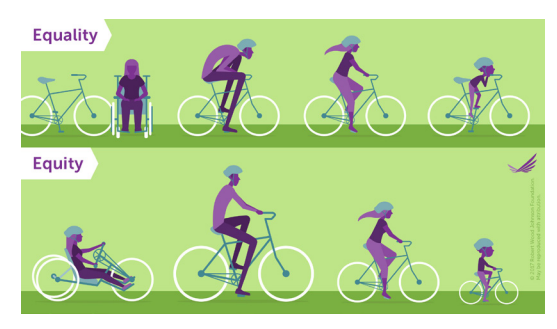
Reproduced with permission of the Robert Wood Johnson Foundation, Princeton, NJ.

According to the U.S. Office of Disease Prevention and Health Promotion, social determinants of health (SDOH) are defined as "the conditions in the environments where people are born, live, learn, work, play, worship, and age that affect a wide range of health, functioning, and quality-of-life outcomes and risks." Other researchers report that "lack of access to healthy food options and the presence of food deserts .... contribute to the racial inequities in hypertension management and control. In particular, lack of access to affordable, healthy, and nutritious food has been linked to poorer health outcomes, with food insecurity associated with a 14% to 77% increased risk of hypertension." In 2019, the United States Department of Agriculture reported that Black, non-Hispanic households experienced food insecurity at significantly higher rates (19.1%) than their white, non-Hispanic counterparts (7.9%).4